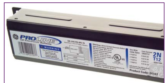
Also available in convenient Shrink wrapped (DIY) tray packs.